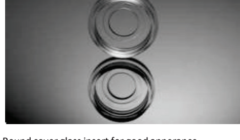
Round cover glass insert for good apperance